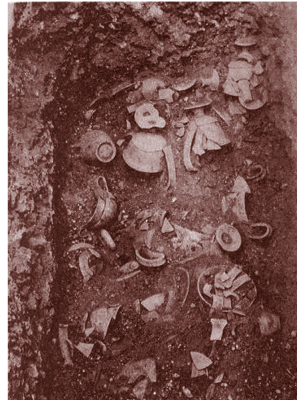
Rhitsona Grave 130 (right), 6th century BC. This grave had fragments of large iron nails amongst the pottery denoting the use of a wooden coffin.