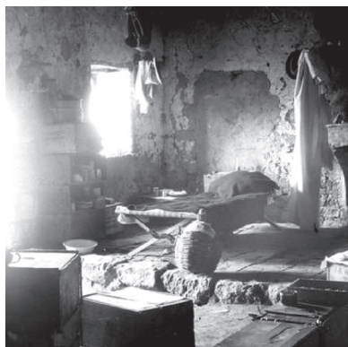
The 'best room in the house.' The packing cases, used as furniture, can be seen in the foreground.

There were no more Rhitsona digs after 1922, partly due to the Ures' growing family but also due to the political situation in Greece and Europe. The Ures published the final publication of the Rhitsona finds in 1934.