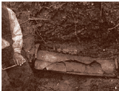
Shaft grave 114a, Rhitsona. Tiled box grave for infant.

Among its more than 2000 objects, the Ure Museum houses perhaps the fourth largest collection of Greek ceramics in the UK. Its inception came in 1909 when Lady Flinders Petrie, widow of the eminent archaeologist and Egyptologist Sir William Flinders Petrie, donated a collection of Egyptian antiquities to Reading College as it was then known (Reading did not receive its University Charter until 1926). Similar gifts made over the years included a small collection of vases bought cheaply on the continent by Percy and some 'unconsidered trifles' from the British Museum. In 1961 Her Majesty the Queen kindly donated a Roman tombstone from Leptis Magna which can be seen in the entrance area of the Museum. Originally given to the Prince Regent in 1816 by the Bashaw of Tripoli, it remained in the courtyard of the British Museum until 1826, when it was moved to Virginia Water as part of the 'ruins' erected by Sir Jeffry Wyattville; then on to Windsor Forest in 1927. The centerpiece of the museum is a reconstruction of Rhitsona Grave 145. It was the last grave to be excavated by the Ures in 1922 and serves as a tribute to them and their dream to 'give life and variety to the study of Greek History.'