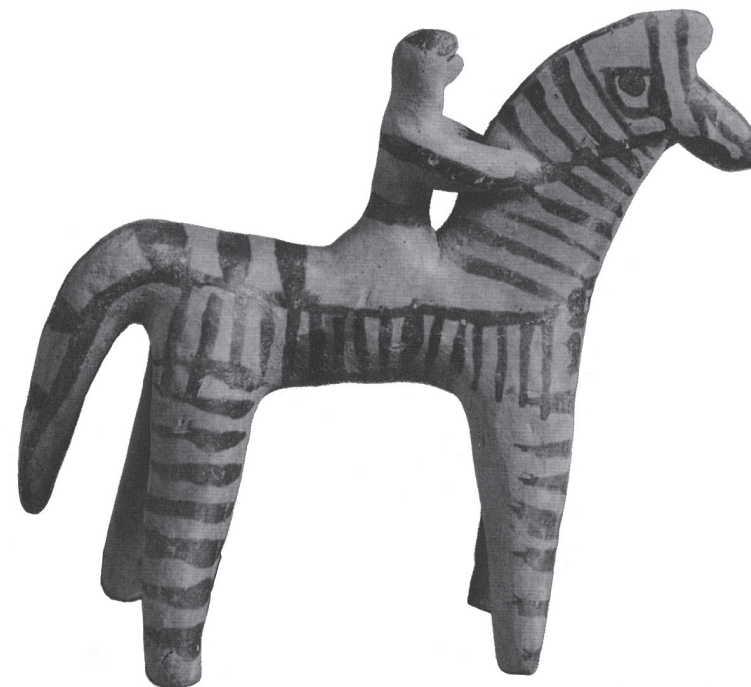
Terracotta monkey (or man) on horseback , middle of the 6th century BC [22.9.8]. Many such items were sold by peasants who scavenged the sites for the tourists. The export of these items was strictly forbidden unless suitable paperwork was obtained. See the 'Warfare' case in the museum.

When they finally arrived in Greece, a permit was required before any work could begin and, when granted, it was on condition that they employed local citizens, many of whom were tomb robbers (a punishable offense). Rather curiously these casual workers not only knew where to find graves, but also seemed to know whether or not a grave would be empty (an observation made by Annie Ure in one of her diaries).