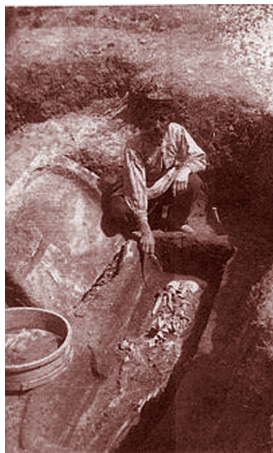
Grave 88, 6th century BC , had a sarcophagus of stone. A stone olive press covered the head and torso, while another stone covered the lower part of the body.

The successful excavations were continued each year from late Spring, when time, teaching schedules and the political situation allowed (the monarchy in Greece was under constant threat). The contents of each grave, some dating to the Geometric and Corinthian periods (7th and 6th centuries BC), were carefully studied and catalogued in situ , even down to the smallest sherd, and the chemical balance of the soil. Each pot was carefully cleaned and pot menders were hired to stick them together. They were then photographed, catalogued and stored. Many were eventually displayed in the Thebes Museum, where they remain on display today.