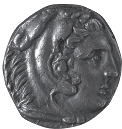
Silver tetradrachm from Amphipolis, 315–294 BC [2006.6.1], showing Hercules with a lion scalp headdress. Reverse shows Zeus enthroned. See the 'Egypt' case in the Museum.

Percy defended himself by asserting that his approach was from the 'archaeological [rather] than from the artistic point of view.' In a letter to Gilbert Murray, Ronald Burrows wrote 'great pressure was put upon us to publish only show vases, and not to adopt the catalogue form ... Our faults, of which we are painfully conscious, lie not in recording too much, but in observing too little.' As Victoria