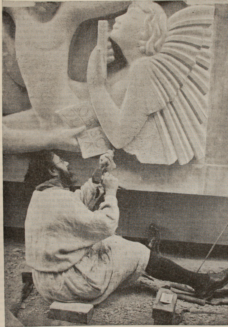
Eric Gill executing one of his sculptures on the new B.B.C. Headquarters, Portland Place, London