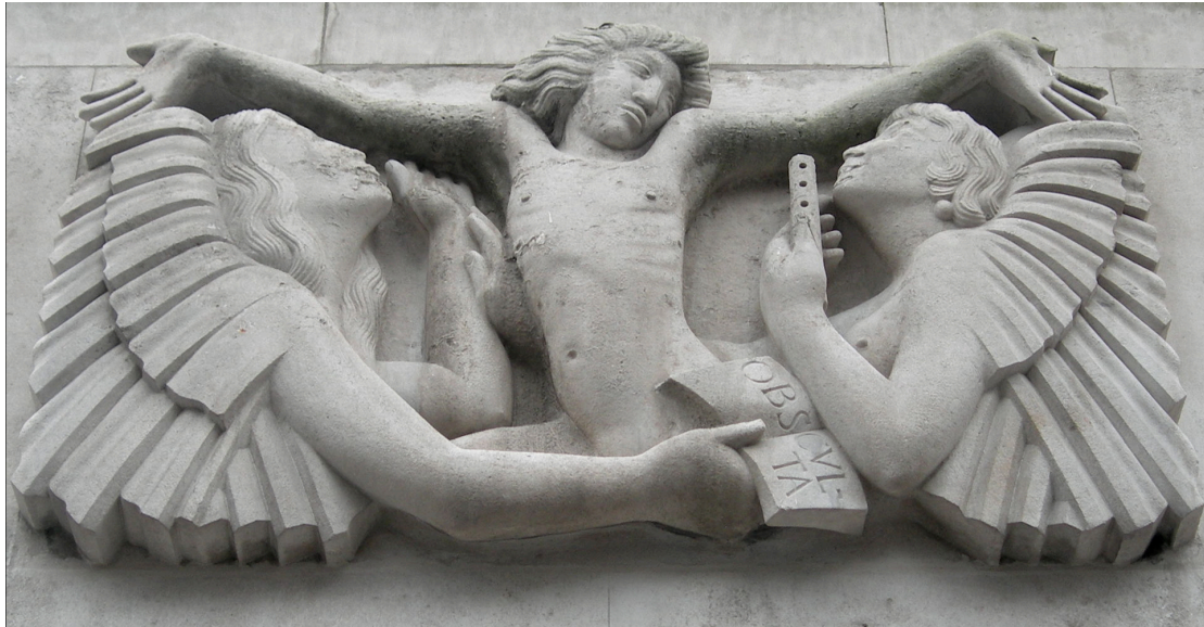
'Ariel Between Wisdom and Gaiety', in situ panel over Portland Place entrance, Broadcasting House, London.