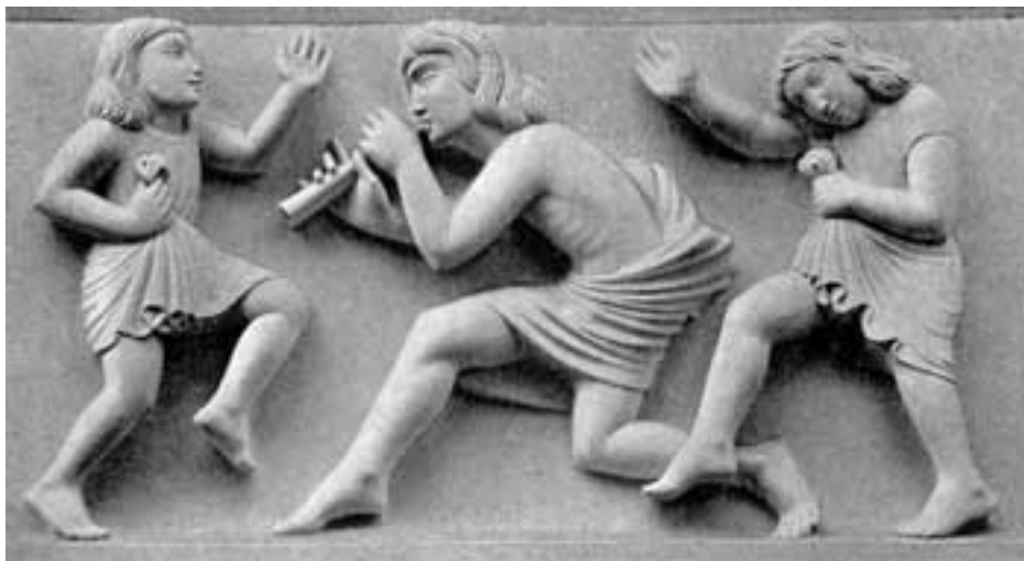
Model (not in situ panel) for 'Ariel Piping to the Children'. Langham Street, Broadcasting House, London.