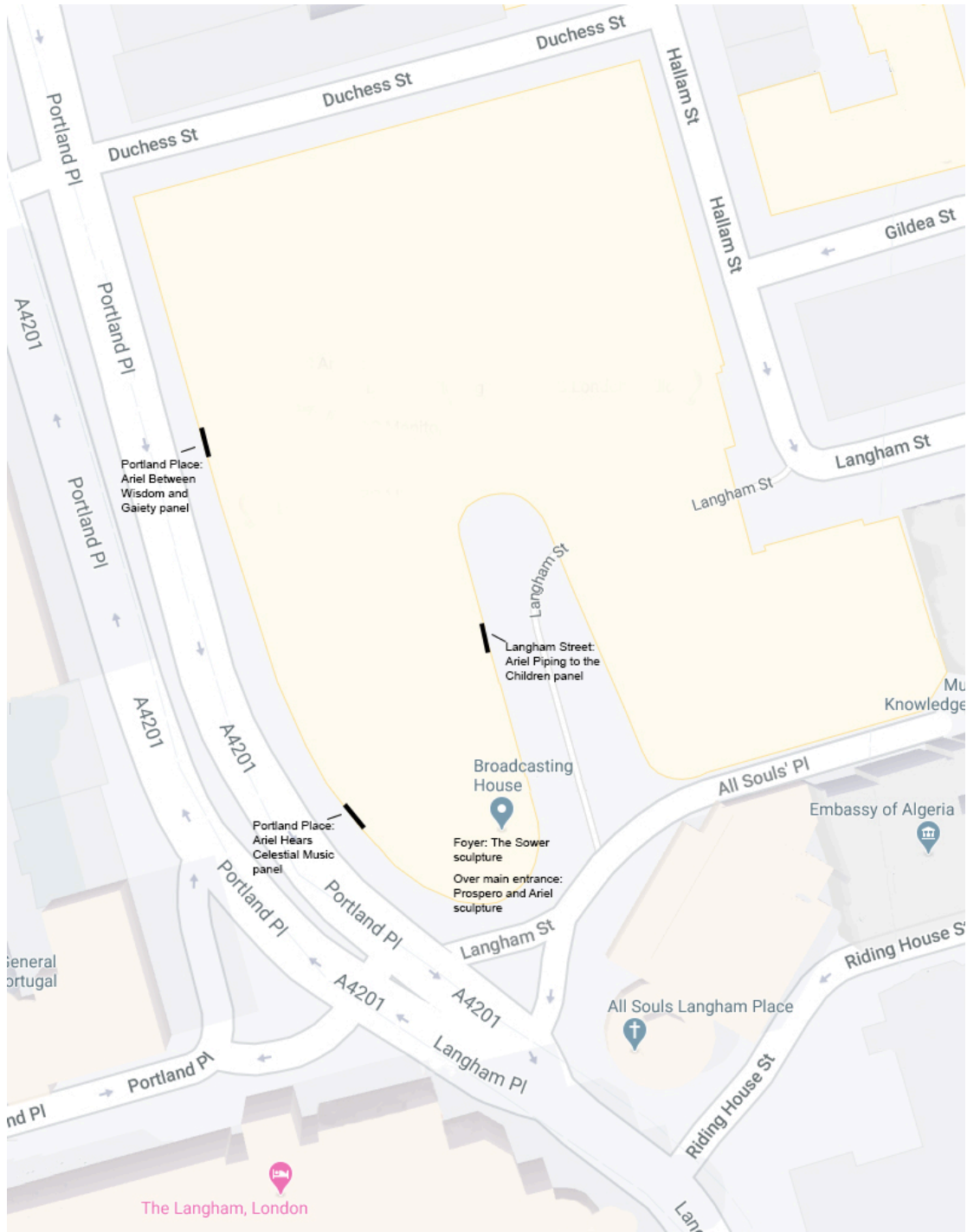
Location of the three Ariel panels at BBC Broadcasting House, London (as well as 'Prospero and Ariel' over the main entrance, and 'The Sower' inside)