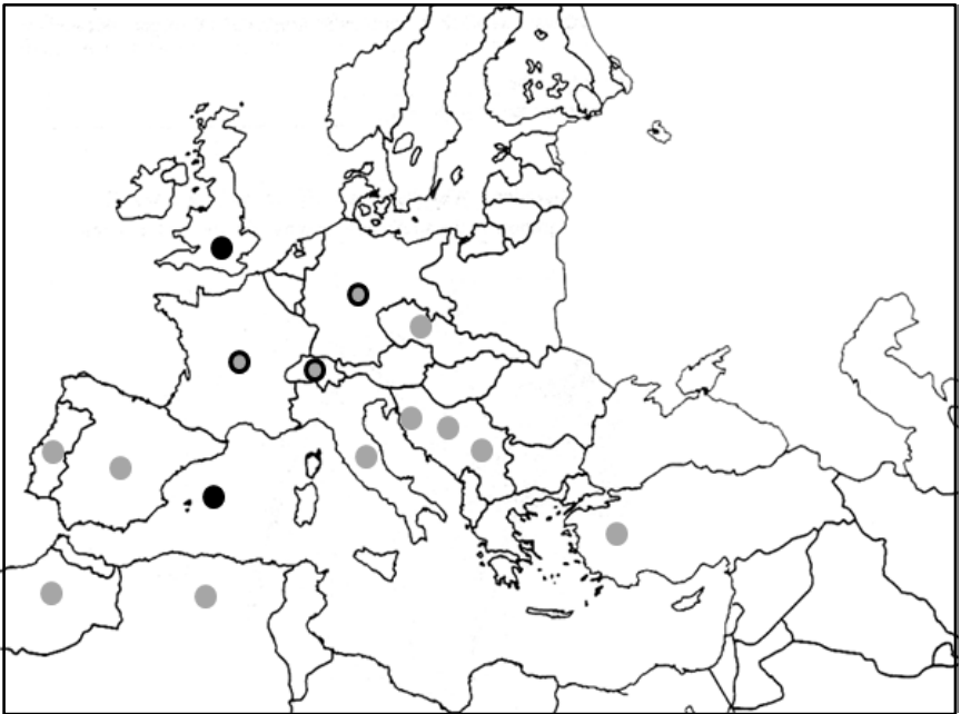
Fig. 2 Current known distribution of Anthrenus angustefasciatus . ● = data from Kadej et al. (2007), ● = data published since Kadej et al. (2007), ● = additions from the current study.

The National Dermestidae Recording Scheme is run through Biological Sciences at the University of Reading. Records should be submitted via iRecord with attached images for verification but GJH would be very happy to assist with identification of